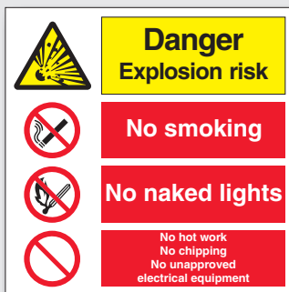
3108 MM ▲