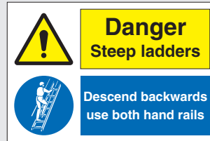
WR 3116 KM