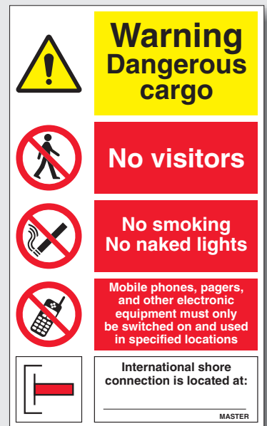
WR 3014 VR