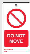
WR 2524 HF ▲