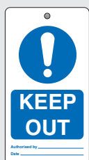
WR 2540 HF ▲