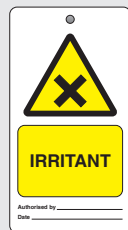
WR 2506 HF ▲