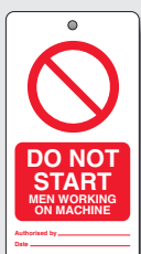
WR 2527 HF ▲