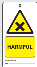
WR 2505 HF ▲