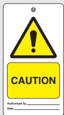
WR 2501 HF ▲