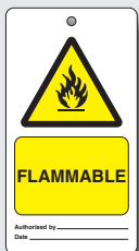
WR 2508 HF ▲