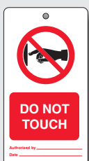
WR 2531 HF ▲