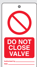
WR 2520 HF ▲