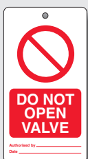
WR 2521 HF ▲