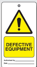
WR 2502 HF ▲