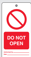
WR 2523 HF ▲