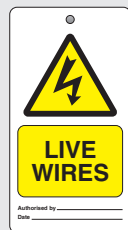
WR 2542 HF ▲