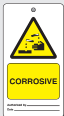
WR 2507 HF ▲