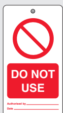
WR 2526 HF ▲