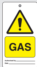
WR 2541 HF ▲