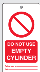
WR 2529 HF ▲