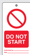
WR 2525 HF ▲