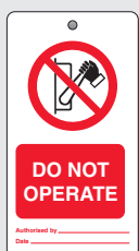
WR 2530 HF ▲